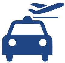
Airport Pick Up