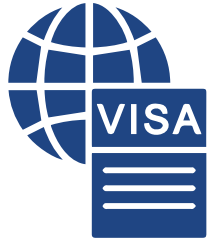
Visa Support Assistance