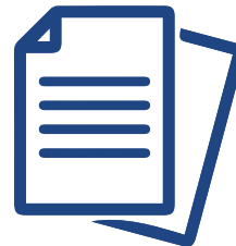
Residency Document & Support