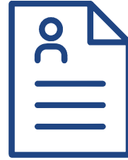
CV & Career development workshop