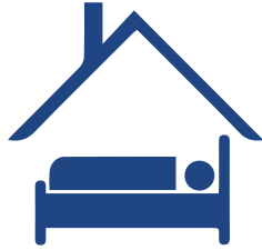
Student Accommodation Guidance